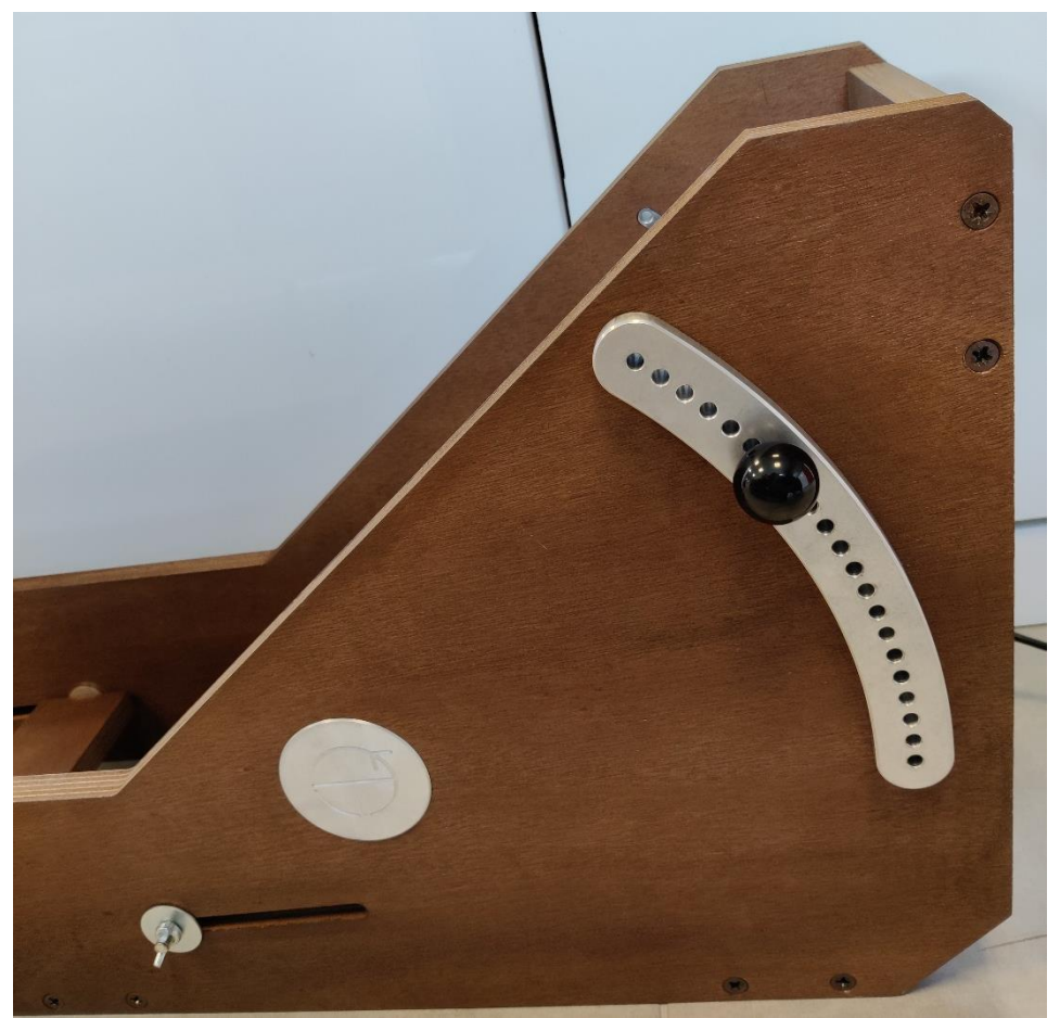
Fig. 3. Ankle angle set.