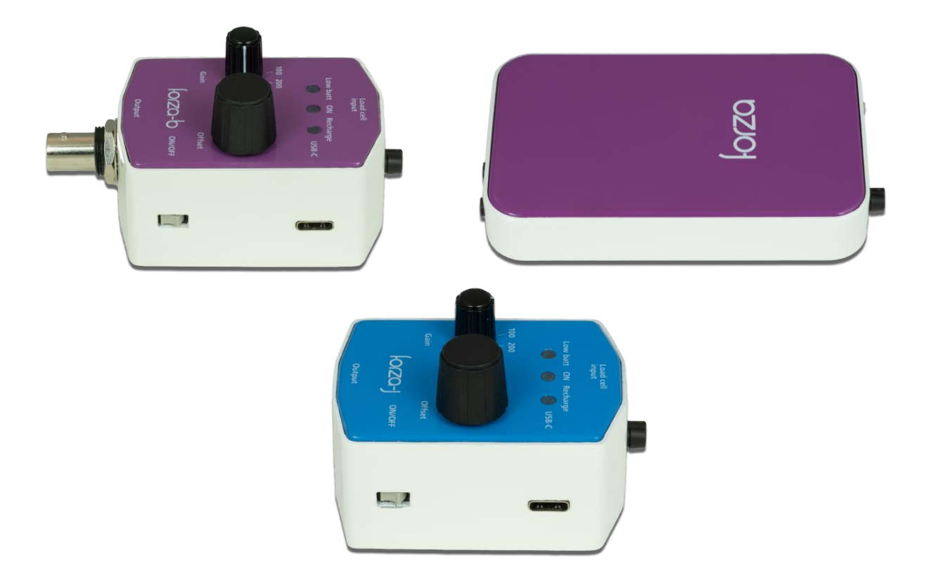
Fig. 6. Forzab, forza and forzaj load cell amplifier.