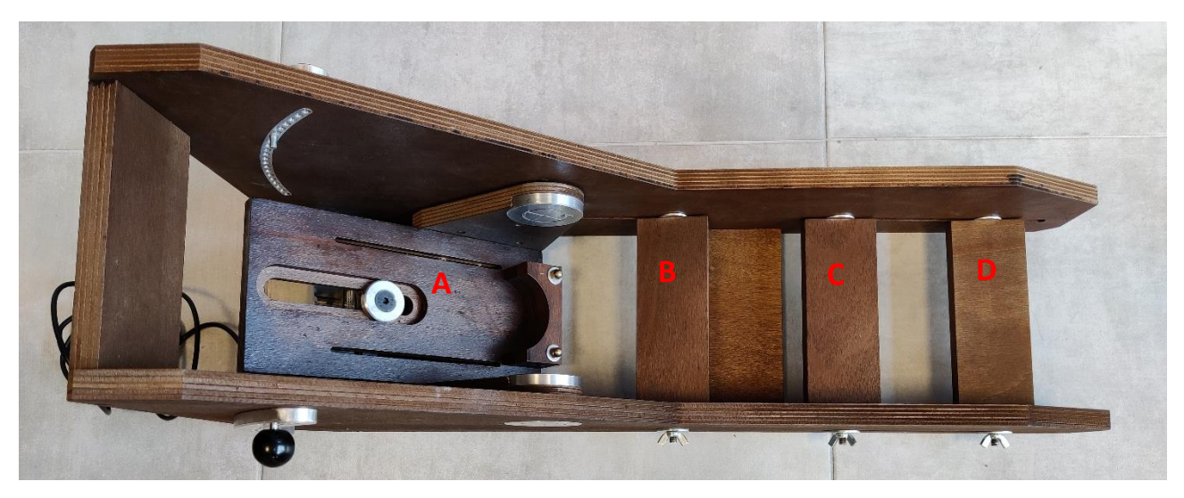
Fig. 1. The ergometer NEG1. A: the footplate. B, C and D: positioning system for the leg.

The leg has to be placed in the dinamometer and the positioning system (see Fig. 1) can be moved to fit the most confortable position for the subject.