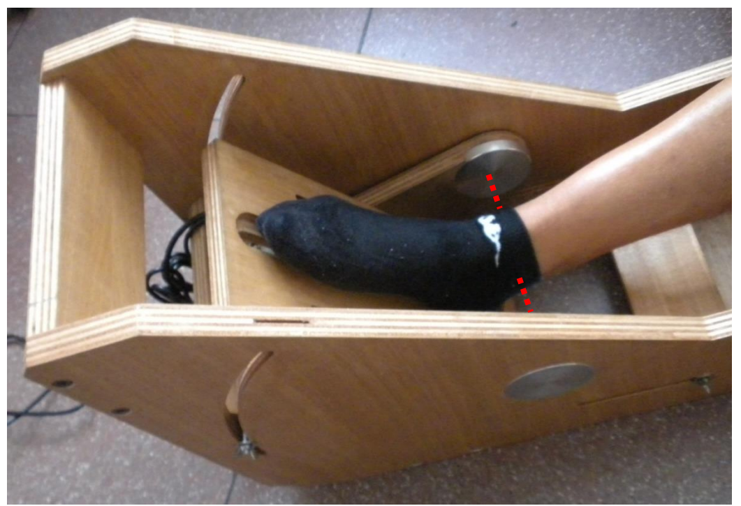
Fig. 2. Alignment between ankle and ergometer centers of rotation.