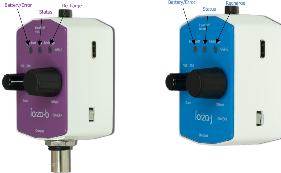
Fig. 7.3: LEDs indicators of the forza-bj accessory.