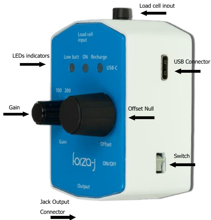
Fig. 7.2: Controls, indicators and connectors of forza-j accessory.