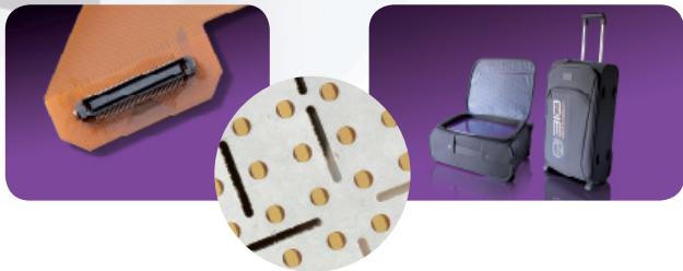
Safe storage and transport trolley