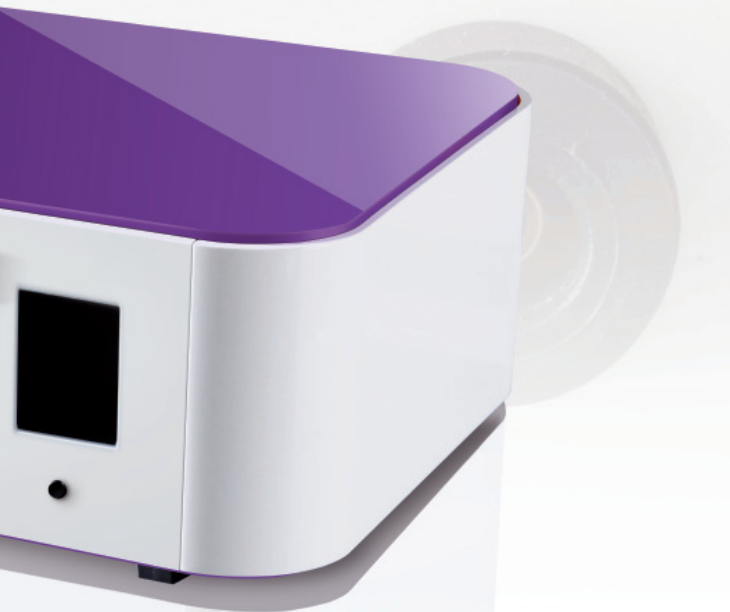
HD detection system